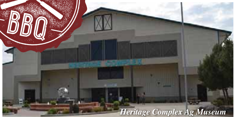
Heritage Complex Ag Museum