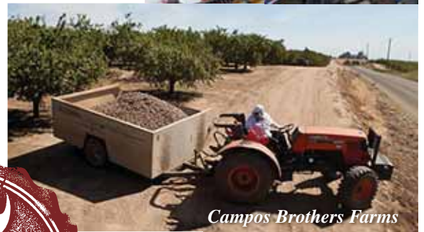
Campos Brothers Farms

The Heritage Complex Ag Museum at the International Agri-Center will be home to the 2018 California Classic BBQ & Scholarship Auction. Don't miss the opportunity to catch up with old friends, meet new ones and support the fund-raising efforts of the California Chapter's Scholarship Team. All proceeds go directly to fund scholarships for Chapter Members pursuing accreditation, assistance to the student internship program and other student programming.